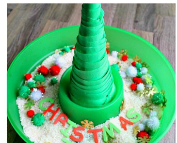
Christmas Sensory Bin and Sticky Tree

A plastic veggie serving tray works well for this activity because the tree fits perfectly in the middle and would prevent it from falling over.